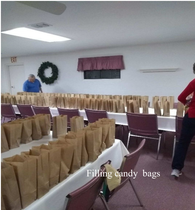
Filling candy bags

and a host of other loving gestures around them. Do what you can do and ask God's blessings on your endeavor for neighbors, friends, and family.