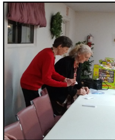
Preparing Christmas bags for prison inmates