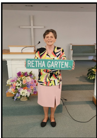
NFCC'S newest Place (street)